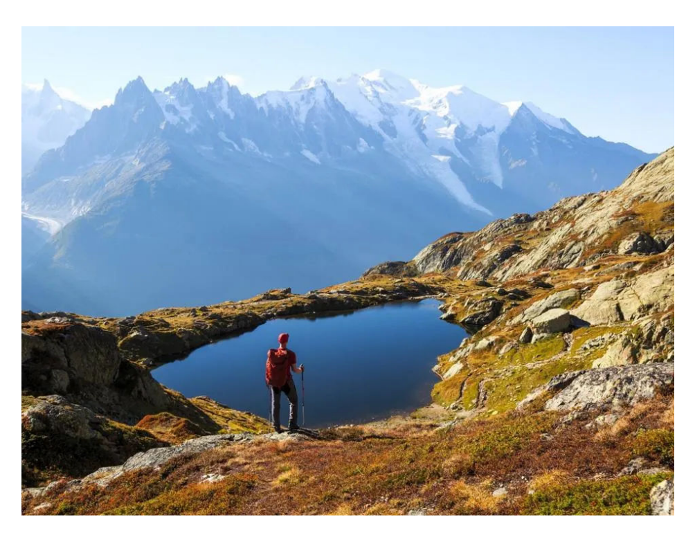
French and Italian Alps with Trek Travel

Trek Travel, long a leader in bike tours, got into the walking and hiking business in 2024 with their first four trips. For 2025, they're offering a French and Italian Alps Hiking & Walking Tour. The six-day walk gives you a taste of the famed Tour du Mont Blanc, Europe's highest peak and most famous circuit walk. The walk includes traveling through the French Alps and into the Italian Alps, walking in the famed Col de la Seigne, crossing the border by gondola from Chamonix to Courmayeur via the Aiguille du Midi, and exploring the challenging Beaufortain region. Rated 4 (out of 5) for difficulty, the trip is priced from $4,399.